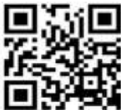
Smart Events QR Code

Consider keeping your costs down and have us provide training to your organisation via this method which can be quite inexpensive compared to running a "live" seminar with a meeting facility, travel costs, etc. We encourage you to give a webinar a try!