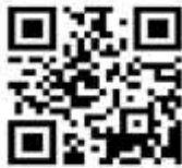
VSW QR Code

Trying out new forms of technology like webinars can feel somewhat intimidating. We think so too! However, it is the future and we want to embrace it along with you.